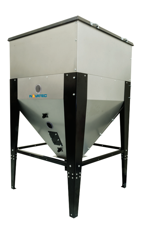
Covered material storage bins and Gaylords help to minimize plastic pellet moisture regain and contamination.

Check your drying system for air leaks. Leaks allow ambient air/moisture from the environment to enter your drying systems, making it necessary for your dryer to work harder to heat and dry plastic resin. Ensure hoses, clamps, fittings, and gaskets are in good condition, free from wear, and securely connected. Replace any hoses that show signs of damage or wear. Reposition or tighten any connections. Replace worn gaskets. Inspect your hopper door to make sure the seal is in good condition and has no leaks. Replace the hopper door gasket if necessary.