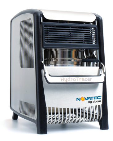
The HT3 HydroTracer by aboni for Novatec can be used to measure initial moisture when offline process verification is needed.