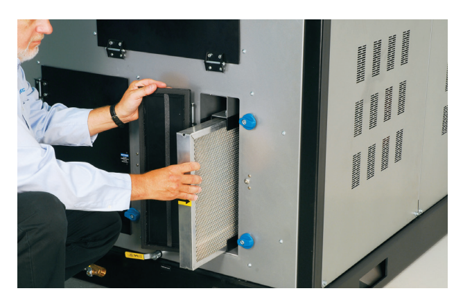
A well-maintained plasticizer trap must be used when drying plastic resins that release volatiles.